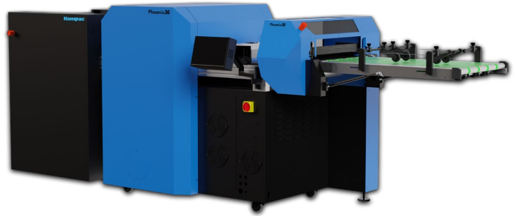
Phoenix 30, shown with available interface conveyor & pallet stacker.

The Phoenix is a revolutionary new coating/priming system that is the most modular system available. The system can utilize one or multiple coating and curing stations and utilizes our unique Kompac IOtech4 platform.