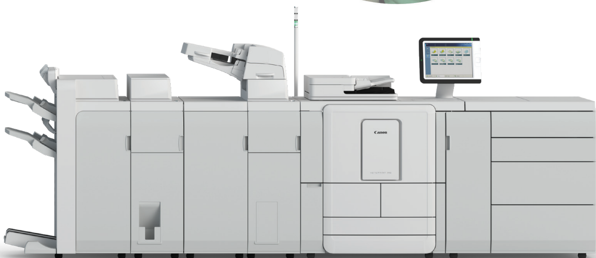
varioPRINT 140 shown with optional accessories.